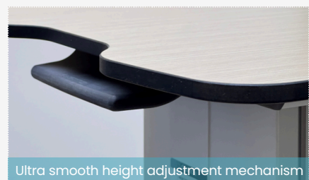
Ultra smooth height adjustment mechanism