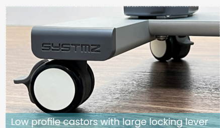
Low profile castors with large locking lever