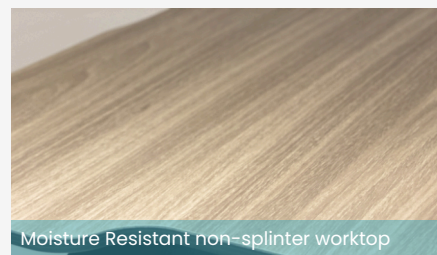
Moisture Resistant non-splinter worktop