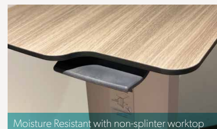
Moisture Resistant with non-splinter worktop