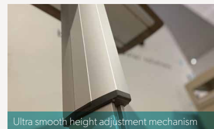
Ultra smooth height adjustment mechanism