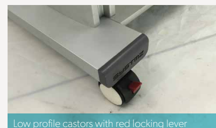
Low profile castors with red locking lever