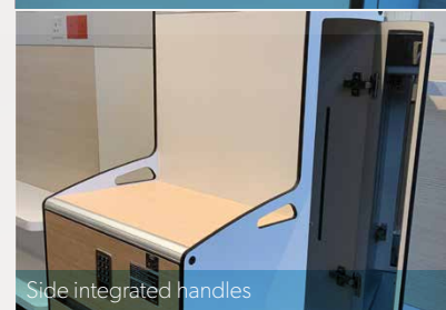
Side integrated handles