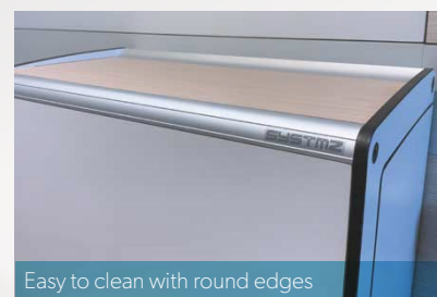
Easy to clean with round edges