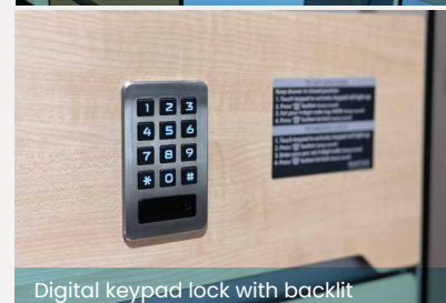
Digital keypad lock with backlit